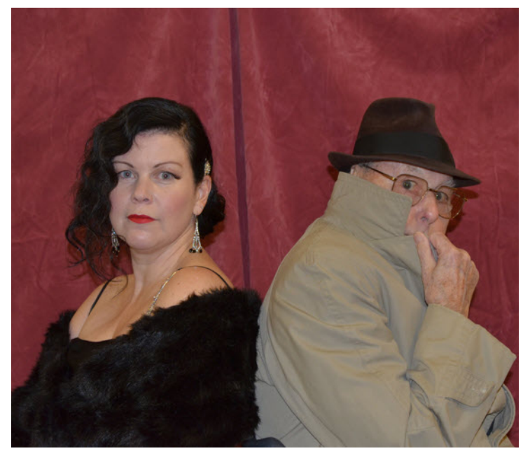
Lady Cynthia Muldoon and Inspector Hound

The performance will start at 7.45 on 8<sup>th</sup>, 9<sup>th</sup> and 10<sup>th</sup> May in Detling Village Hall. Tickets are available from the web site at £12 each and £10 for concessions. The puddings are included in the ticket price. Beam up <a href="https://www.detlingplayers.co.uk">www.detlingplayers.co.uk</a> or phone our dedicated booking line on 07842 169725