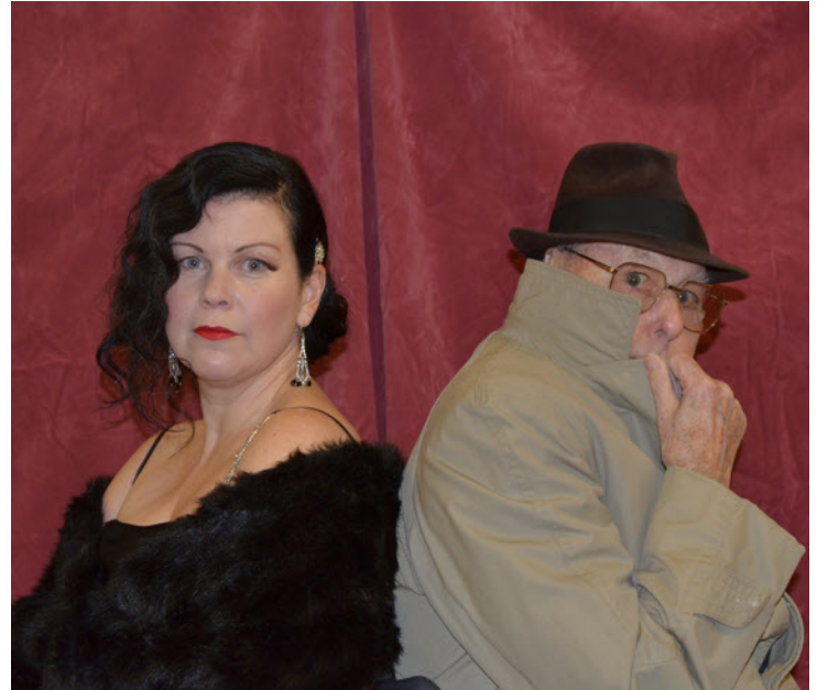
Lady Cynthia Muldoon and Inspector Hound

The performance will start at 7.45 on 8 th , 9 th and 10 th May in Detling Village Hall. Tickets are available from the web site at £12 each and £10 for concessions. The puddings are included in the ticket price. Beam up www.detlingplayers.co.uk or phone our dedicated booking line on 07842 169725